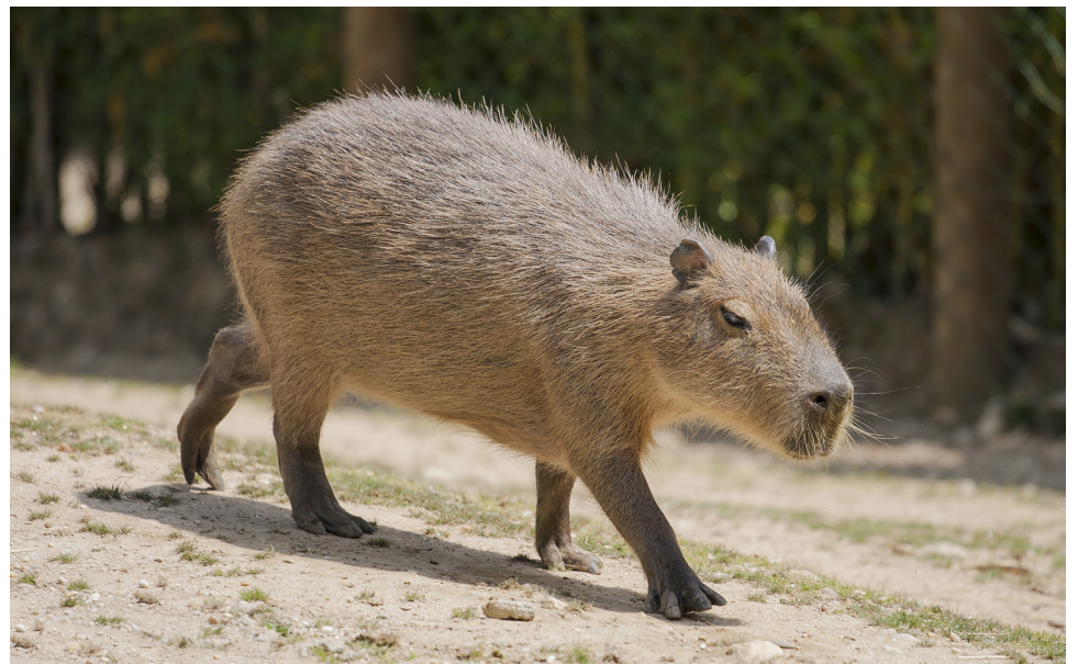
Weiging up to 79 kg (174 pounds), the South American capybara is the largest living rodent.