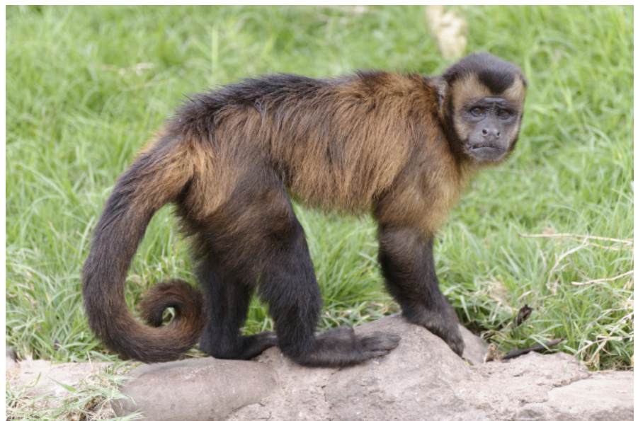
Tufted capuchin monkey from South America.