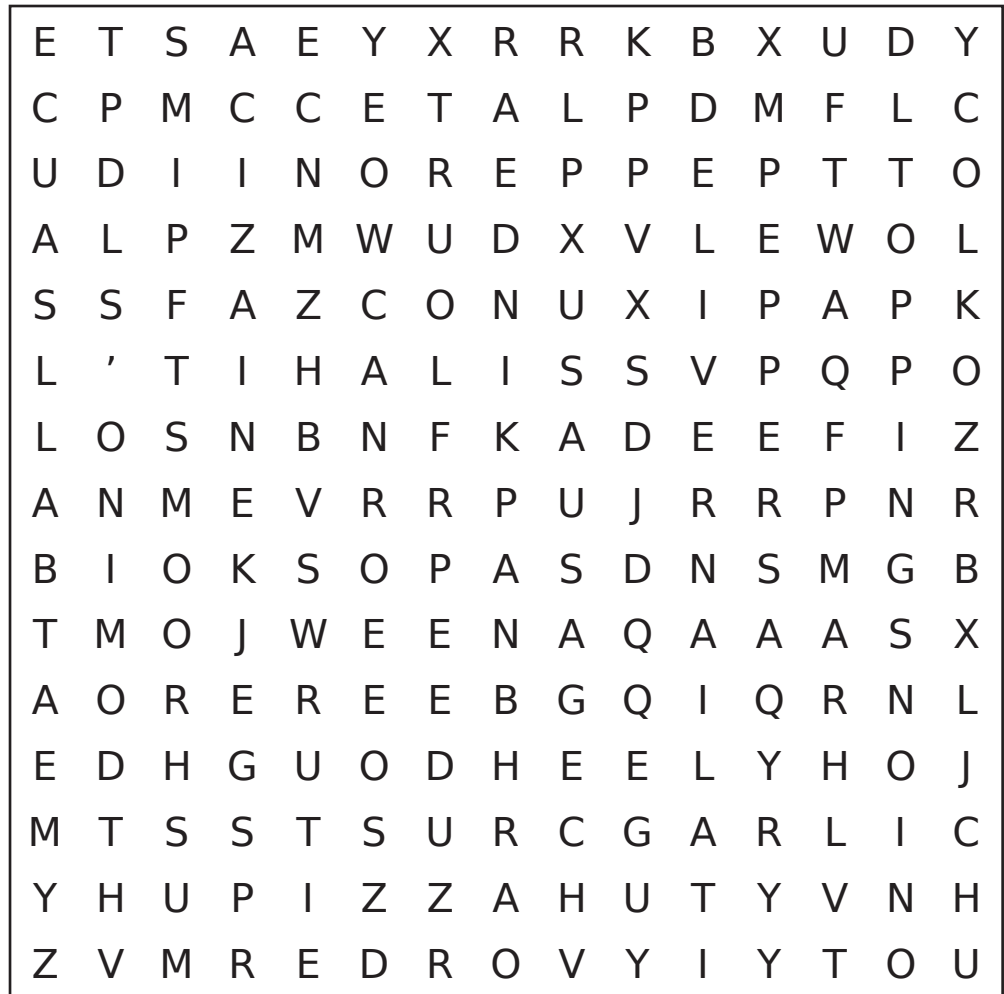
PLATE SAUCE SAUSAGE SLICE SPICY THE WORKS TOMATO TOPPINGS YEAST

BEER CHEESE CRUST DEEP DELIVER DISH DOMINO'S DOUGH FLOUR GARLIC HOT ITALIAN MEATBALLS MUSHROOMS NAPKIN ONIONS ORDER PEPPERONI PEPPERS PIZZA PIZZA HUT