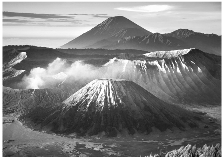
Mount Bromo, is an active volcano and part of the Tengger massif, in East Java, Indonesia.