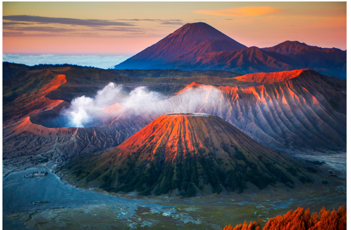
Mount Bromo, is an active volcano and part of the Tengger massif, in East Java, Indonesia.