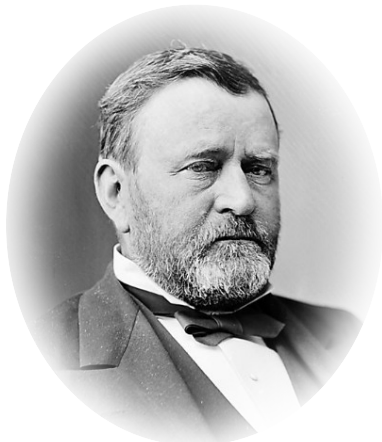
General Ulysses S. GRANT

DIRECTIONS: Find and circle the ALL CAP NAMES in the grid. Look for them in all directions including backwards and diagonally.